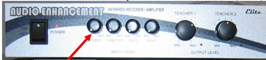
Volume for VCR/DVD and TV